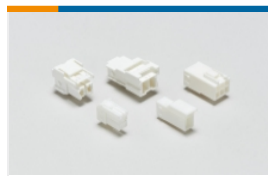
Rectangular Power Connectors(13)